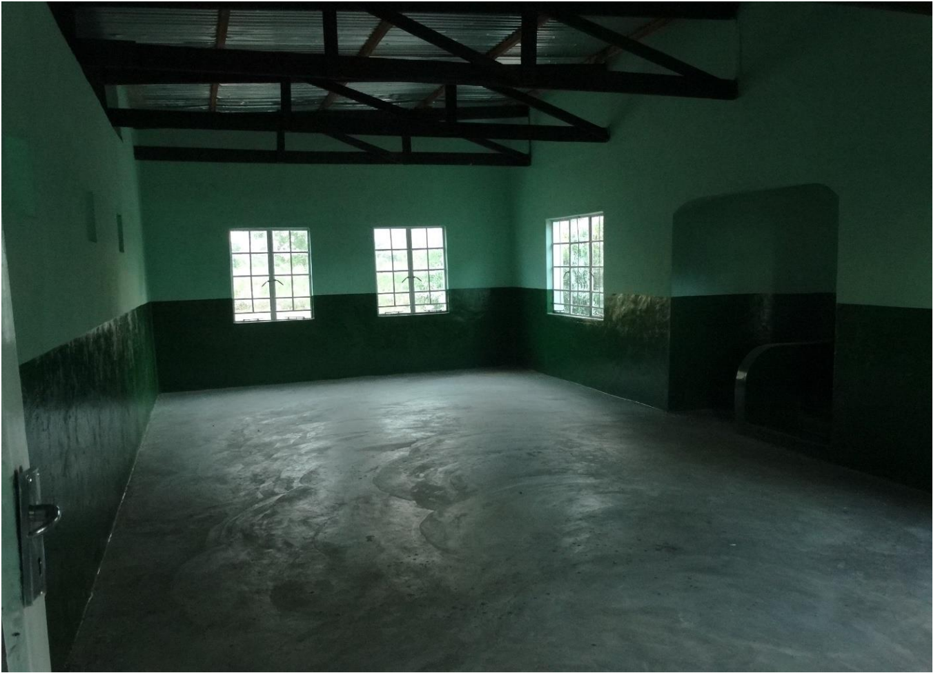
Women's Prayer Hall